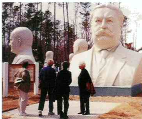
At Presidents Park in Williamsburg, Va., visitors can get up close and personal with larger-than-life-size busts of George Washington (top, in foreground), William Howard Taft (above) and 40 other US presidents.

While most visitors choose to meander along the chronologically organized path,