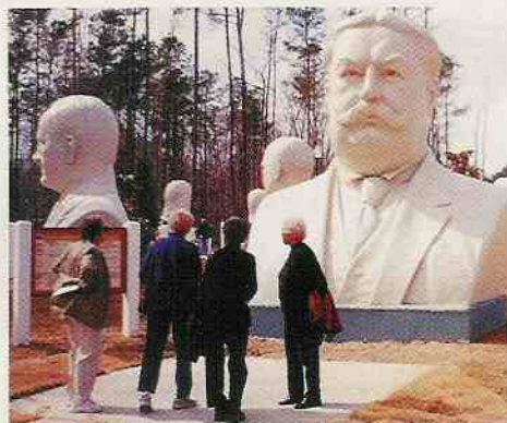
At Presidents Park in Williamsburg, Va., visitors can get up close and personal with larger-than-life-size busts of George Washington (top, in foreground), William Howard Taft (above) and 40 other US presidents.

While most visitors choose to meander along the chronologically organized path,