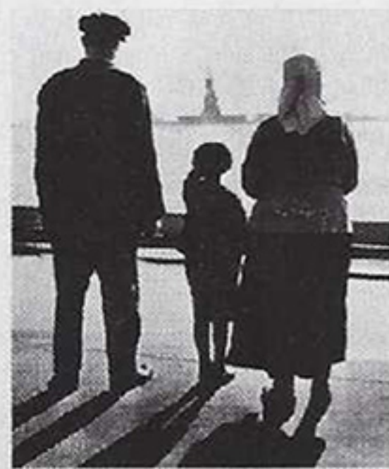
Arrival at Ellis Island.